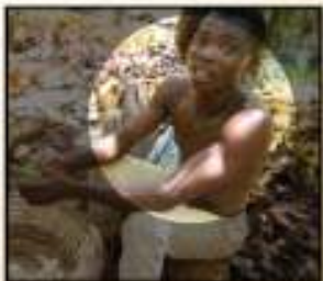
WITH A BITTER TASTE

To mark the bicentenary of the abolition of the Slave Trade in the British Empire, black history is becoming a required part of the school curriculum.