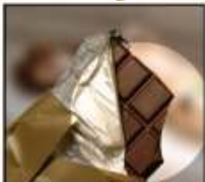
A great deal